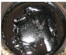
Figure 3: Layer formation during purification